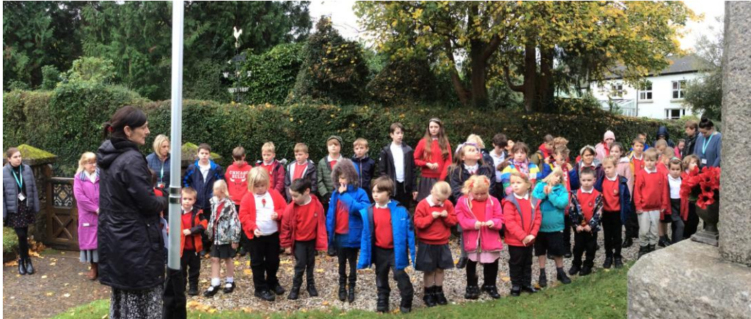
Paying our respects for Remembrance