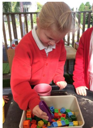
Fine motor skills in Early Years