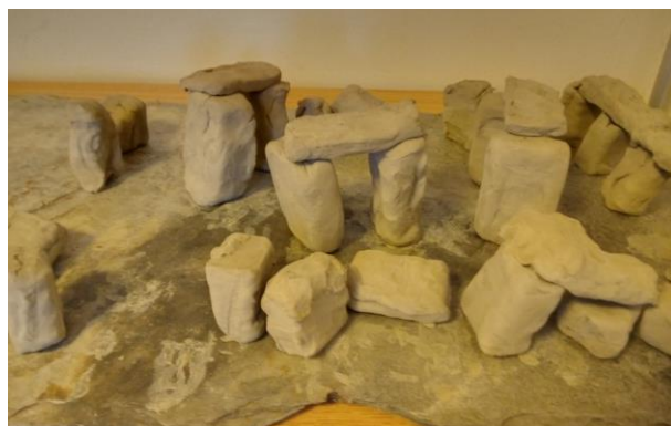
Ben's model – Prehistoric Britain