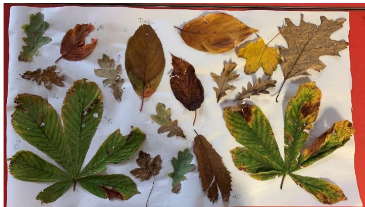
Theo's home learning