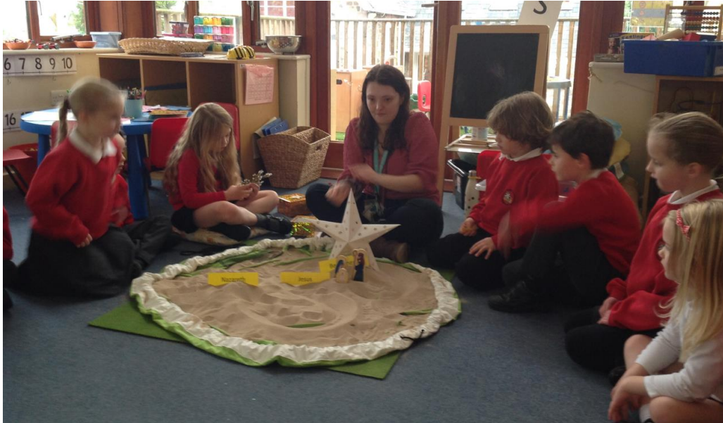
Godly play in Class 1

Let us spur one another to acts of love and good deeds. Hebrews 10:24