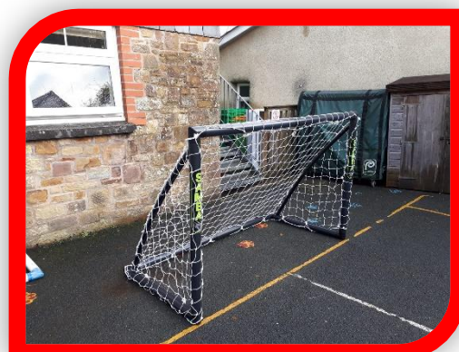
The new equipment includes new goals for the playground