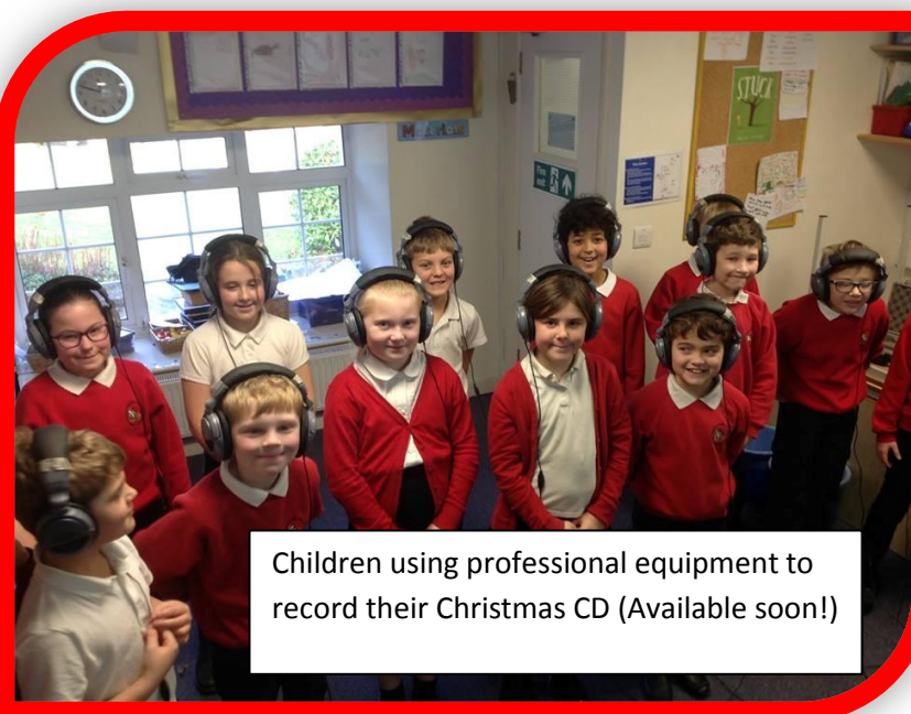
Children using professional equipment to record their Christmas CD (Available soon!)

In the new year (January 18 th ) we will be offering FREE workshops for parents and children around Maths and helping your child achieve their potential. This is part of our wider community and parental involvement.