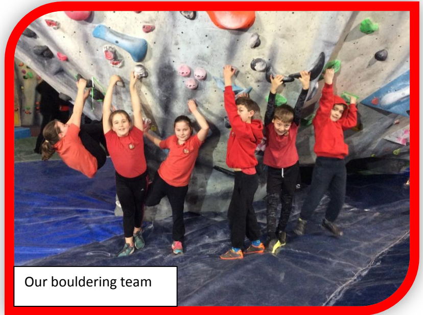
Our bouldering team

This week sees the start of December and many children (and big kids) opening the first doors of their advent calendar. Advent, as the Church of England sees it, actually starts on Sunday and is a time to prepare for the coming ( adventus ) of Christ. An advent wreath is traditional with five candles, representing hope (Prophecy candle), love (Bethlehem candle), joy (Shepherds' candle), peace (Angels' candle) and Christ. These themes are what Christmas is all about and why we celebrate. Remember to keep hold of hope, love, joy and peace during this hectic period!