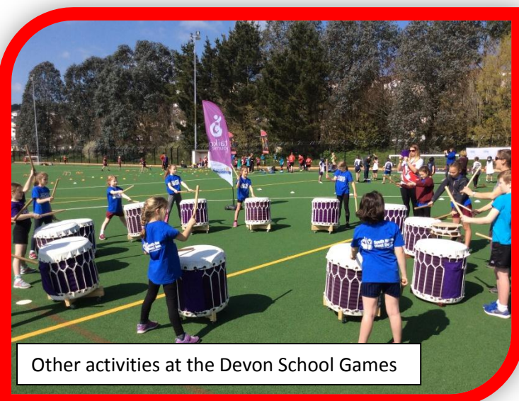
Other activities at the Devon School Games