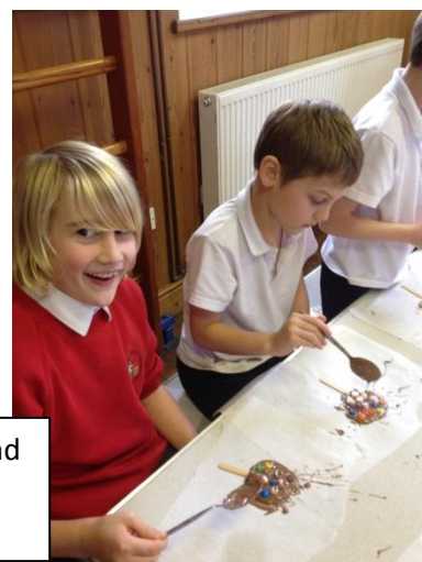
Class three achieved their class award and made chocolate lollies.