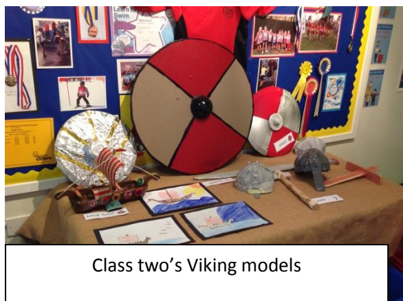
Class two's Viking models

If you have any concerns you can ring the Multi Agency Safeguarding Hub directly on 0345 155 1071