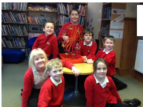
Breakfast club children with their Ferris wheel

The next meeting of the PFA is Monday 5 th March, 7.30 at the Red Lion.