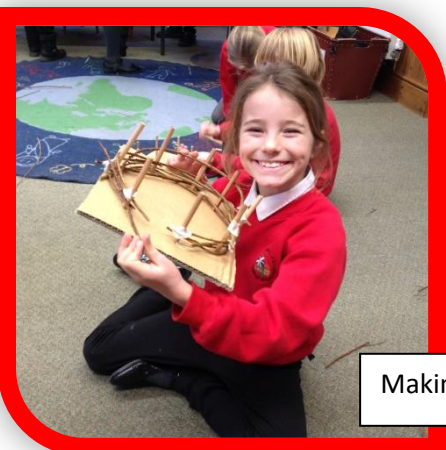
Making a New Stone Age roundhouse!

100% of staff stated they are proud to work at our school.