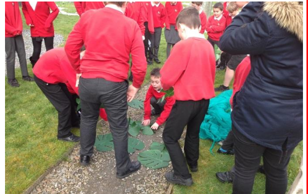
Laying palm leaves on the path to Jerusalem.