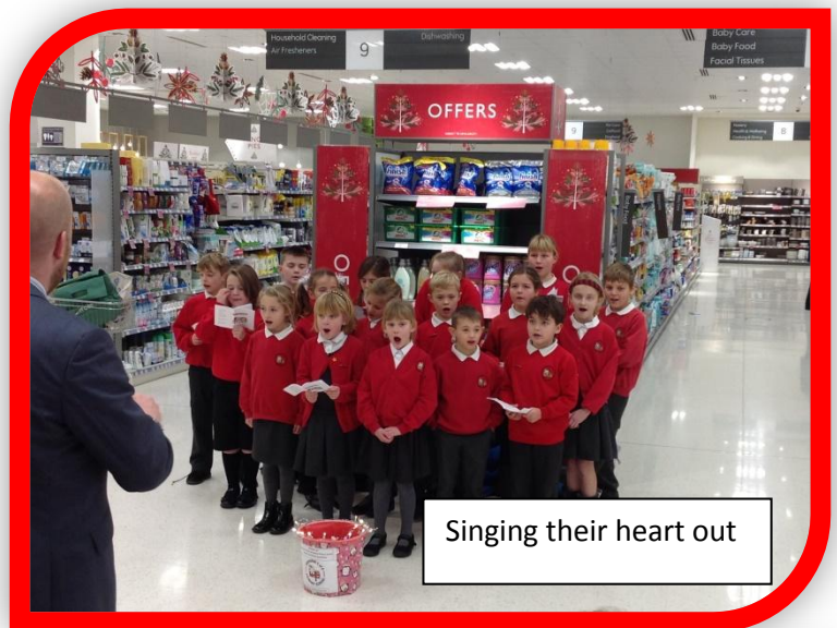
Singing their heart out

Thank you everyone for supporting the school council in their organisation of Christmas jumper day for Save the Children. The children did really well at organising the event and all monies raised will be donated to the charity.