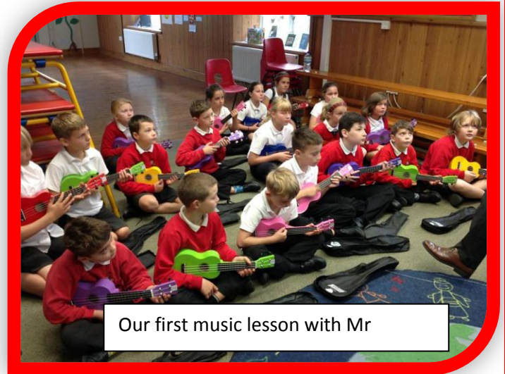
Our first music lesson with Mr

The Church harvest festival is on Sunday 23 rd September.