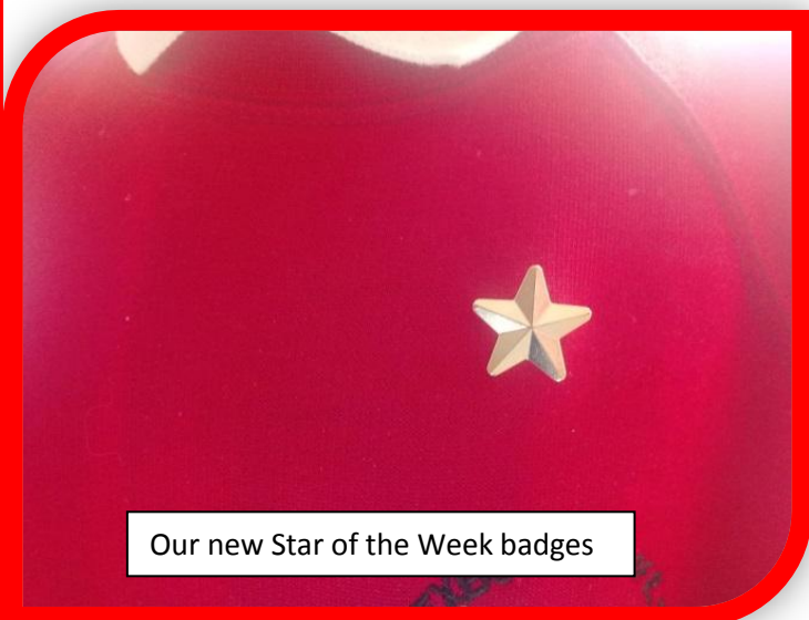
Our new Star of the Week badges

We have also introduced badges for 'Star of the Week' and the Kindness Award. Please return these badges each Thursday so they can be given to the next stars!