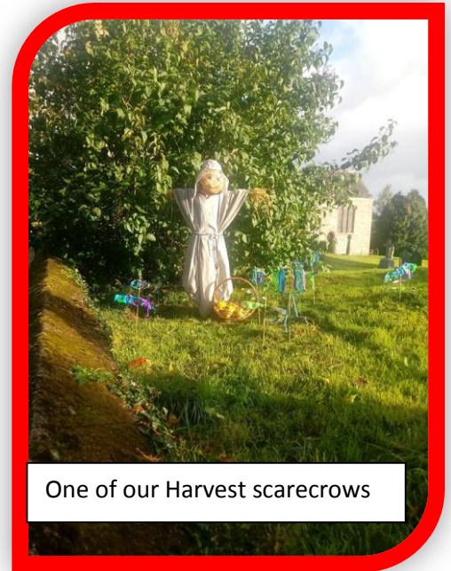
One of our Harvest scarecrows

Can I remind all parents that the playground will be manned from 8.50am. Children arriving before that time must be supervised by a parent or carer unless a prior arrangement has been made. This time is so valuable to the teachers and staff for final preparations for the day. Breakfast club is available from 7.50 – 8.50 daily with later drop ins offered.