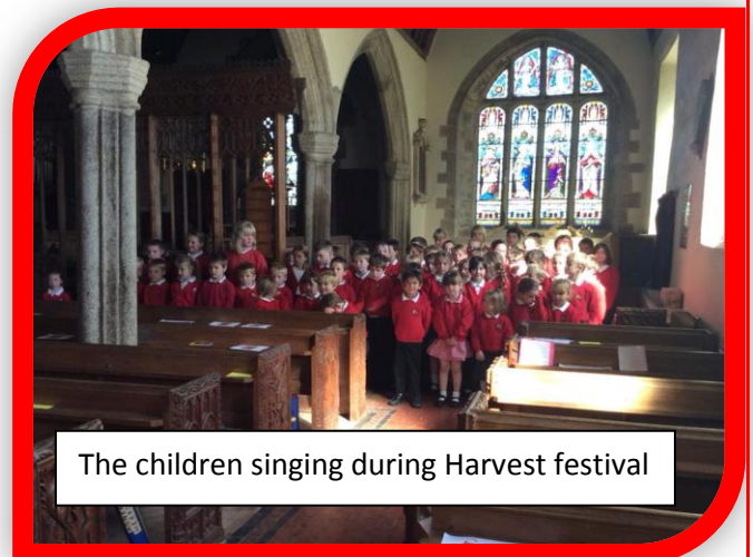
The children singing during Harvest festival