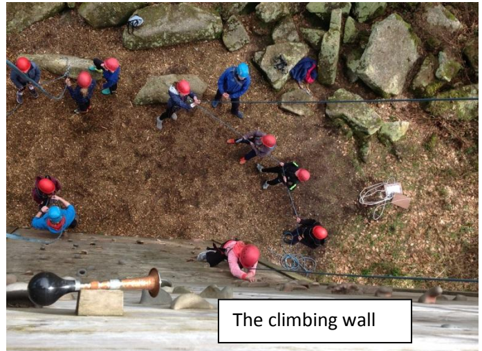
The climbing wall

Well done to the Year 6 children who took part in the Heatree residential over the last few days. The children participated in climbing, abseiling, kayaking, mountain biking and archery. As well as learning valuable life skills like how to make your bed, keep your room tidy and remember to put on clean socks! During the residential the children followed the National Outdoor Learning Award scheme. This is made up of three parts; Respect, Safety and Learning. The children developed independence, resilience and confidence whilst away. They also made new friends from our other Federation primaries by working as a team throughout. Behaviour was impeccable and all the children were a credit to the school – well done!