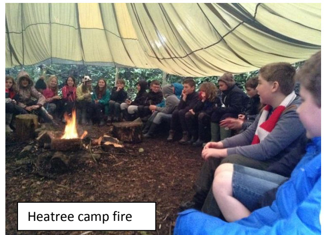
Heatree camp fire

If you have any skills you'd like to share in an after school club, please let me know as I would love to run more extra-curricular activities but the time of our staff is already stretched. You would have the support of a member of staff at all times.