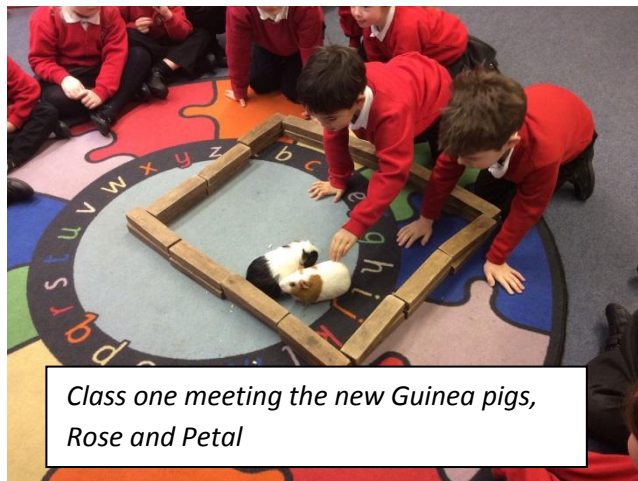
Class one meeting the new Guinea pigs, Rose and Petal

The year groups indicated are indicative but if your child particularly wants to take part in the art or board games club then please speak to your class teacher.